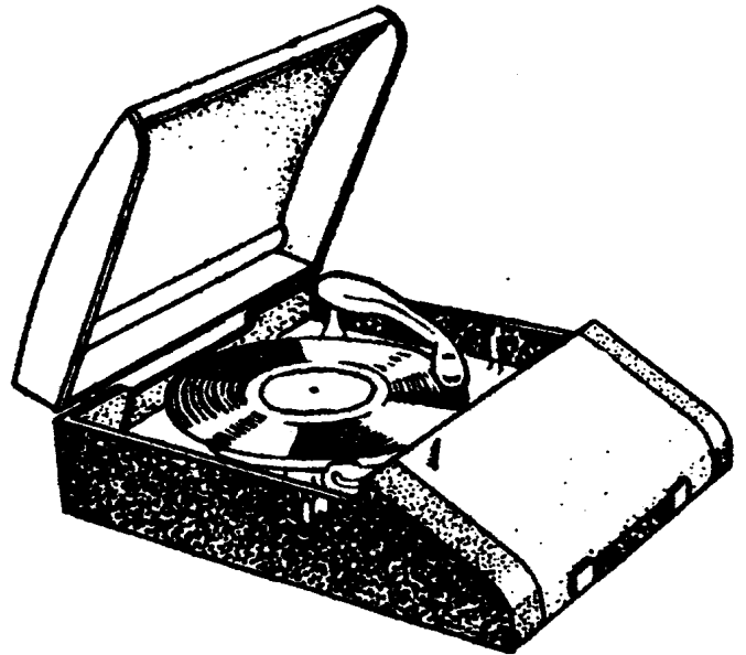
"CADET 880 884"

881 Incorporating multispeed changer either Collaro or B.S.R. To reveal chassis remove the tone and volume control knobs and the panel behind these is secured by two retaining wood screws, on removal of these the panel can be withdrawn. The base panel is removed by the withdrawal of the four feet and screws.