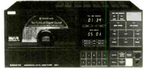
SANYO DAD 8