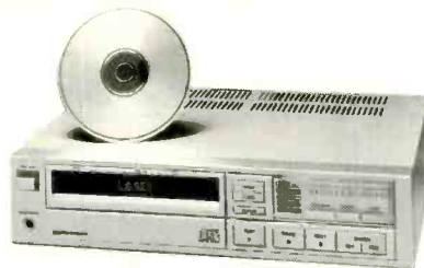
SEARS 57 E 9750C