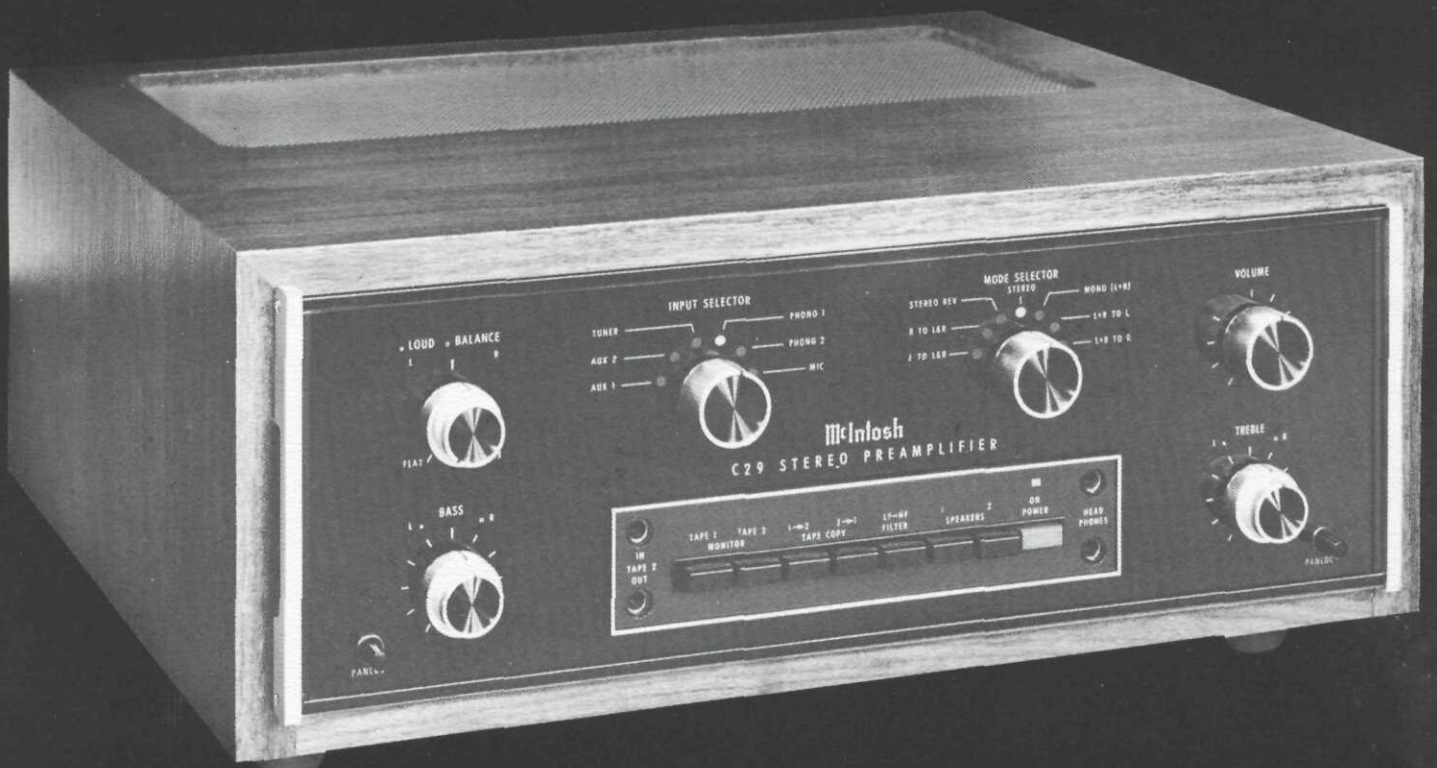
C 29 The McIntosh C 29 is shown in optional walnut veneer cabinet

The McIntosh C 29 is the quietest - most flexible - easiest to use - most advanced stereo preamplifier with the lowest distortion!