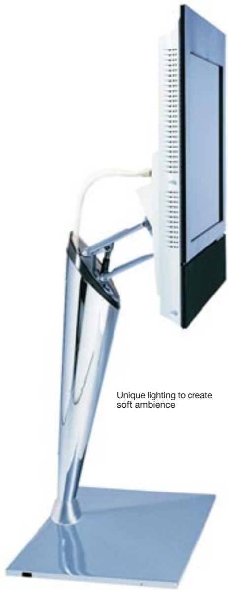
Unique lighting to create soft ambience