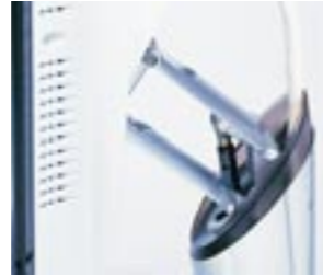
Hinge mechanism for easy height adjustment

Swivel to the left or right for the viewing angle that's just right.