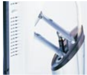
Hinge mechanism for easy height adjustment

Swivel to the left or right for the viewing angle that's just right.