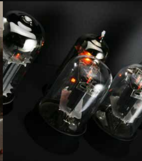
Valves through the ages (left to right): Quad II, QA12/P and PA One ▲