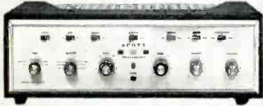
New 299D 80-Watt Stereo Amplifier

This best-selling stereo amplifier, top-rated by all leading consumer testing organizations, is now better than ever. New luxury features include: direct connection for powered center channel and extension speakers, speaker switch for private listening, new switching for choice of five low level inputs, non-magnetic electrolytic aluminum chassis, exclusive Scott Balance Left/Right level balancing system, and massive output transformers. Behind the handsome panel, with its easy-grip knobs, is a lifetime of trouble-free performance and power to spare. $229.95