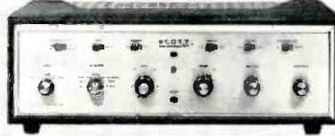
New 222D 50-Watt Stereo Amplifier

There's a new look to the ever-popular 222 series . . . and new performance, too. Massive transformers deliver enough power to drive even the most inefficient speaker systems . . . and the 222D gives you power in the low frequencies, where it's really needed. This value-packed performer incorporates a center channel speaker connection without the need for an additional amplifier, speaker switch for private listening, front panel switch for selection of phono or tape deck. Build a quality music system around this most versatile, feature-filled amplifier. $179.95