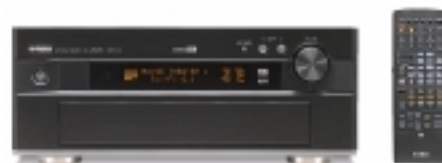
Black finish available