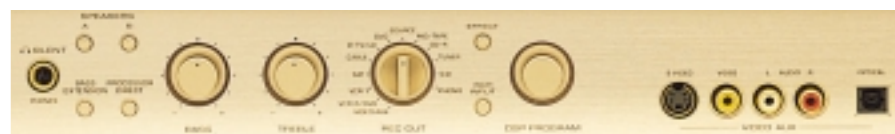
Oil-Damped Hidden Control Panel with Optical Digital and S-Video Terminals